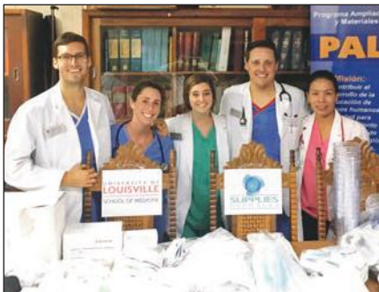
U of L Medical