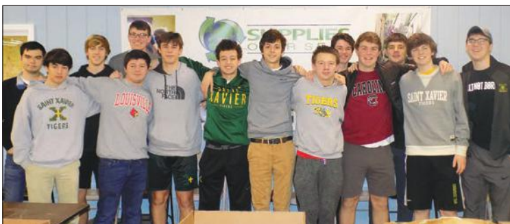
St Xavier High School