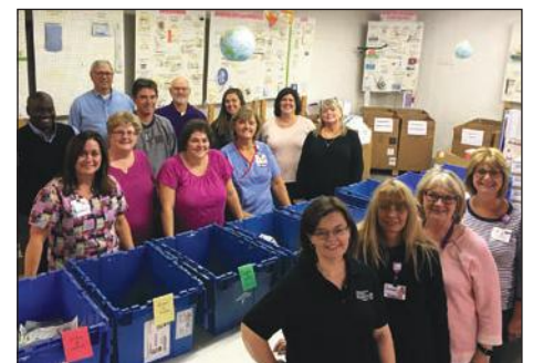
Kentucky One Health