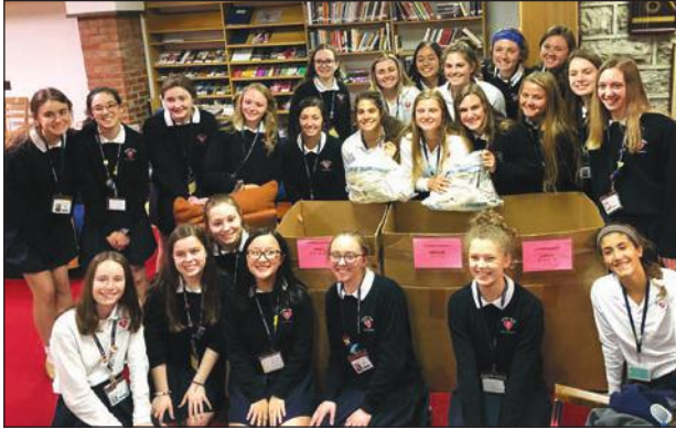
Sacred Heart Academy

These photos represent a few of our Corporations, Schools, Churches, Hospitals, Individuals, Families, Organizations, Sororities, Fraternities and Partners